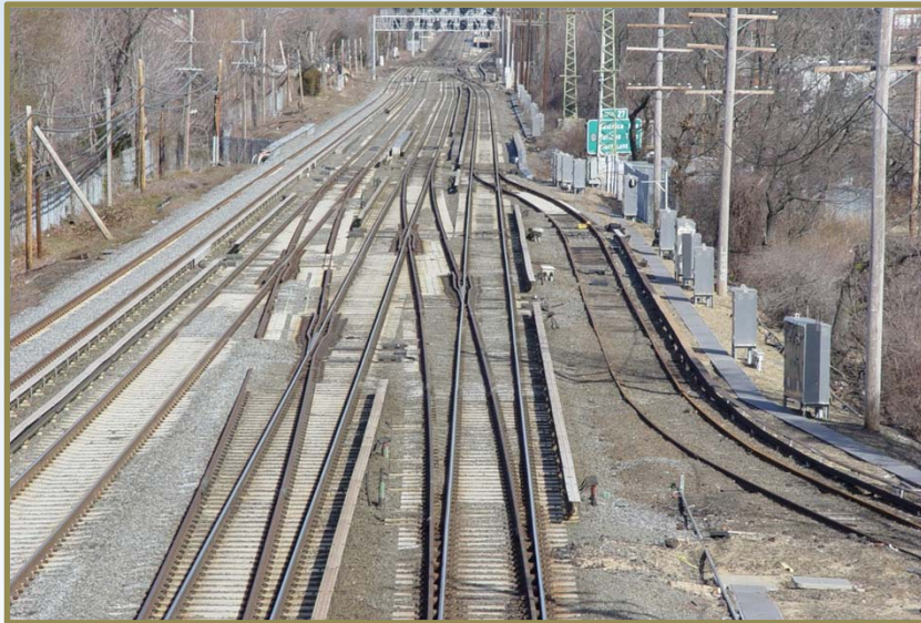
Queens Interlocking LIRR