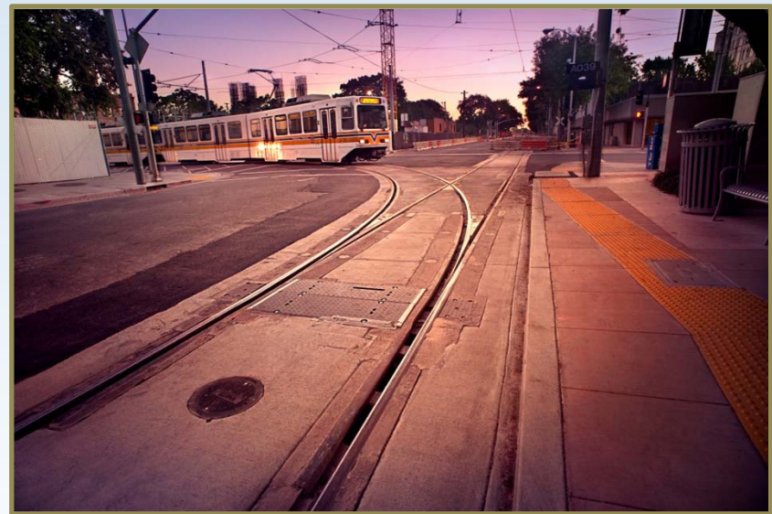
Sacramento 25M Turnout